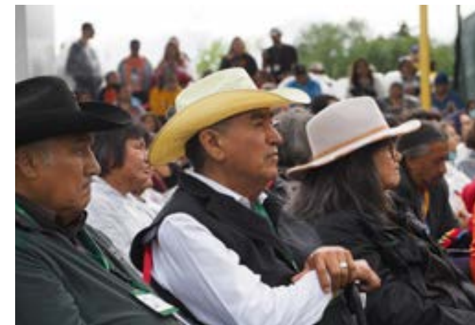
Pope Francis visit to Maskwacis July 25, 2022.

Dial by your location +1 647 558 0588 Canada +1 778 907 2071 Canada +1 204 272 7920 Canada +1 438 809 7799 Canada +1 587 328 1099 Canada +1 613 209 3054 Canada +1 647 374 4685 Canada