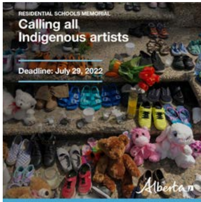
Alberta Government: Residential School Memorial. Indigenous artists can submit a proposal for a memorial on legislature grounds to honour residential school students who never came home. Website: www.alberta.ca/residential-schools-memorial